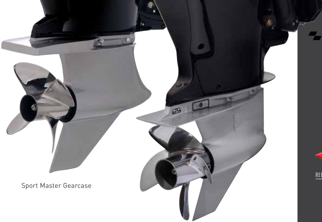
Sport Master Gearcase